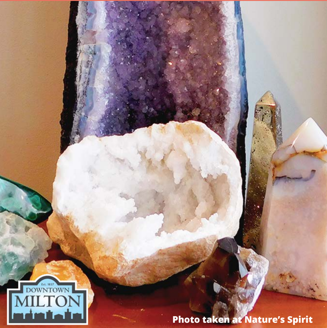
Photo taken at Nature's Spirit